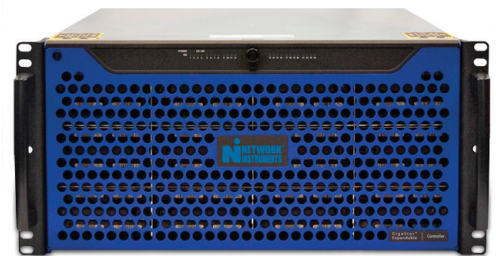
Scale from 8 TB-5 PB with GigaStor 5U appliances